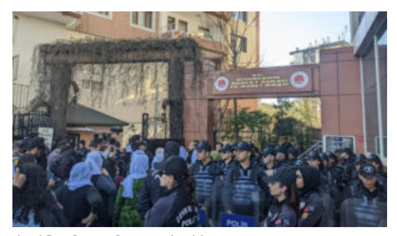
Vigil for forced disappearances

Yeah, I mean, in general, the people who attended, it wasn't only DEM Party members who were there. It's just people in the community, basically, people who agree with the fact that what happened in Van was extremely undemocratic and unfair, and it didn't reflect the will of the people. And the second event, I'm not sure, I would need to find out exactly which groups it was present, actually, and yeah, but there was, like, a kind of mix of people from, like, various groups, and also nonaffiliated people as well. everyone Not was specifically a member of a specific organisation who was present. There was, oh, and the Saturday Mothers as well, the mothers of the martyrs, and also of the missing people who had disappeared in the 90s. So, when everyone was going to this the first court in