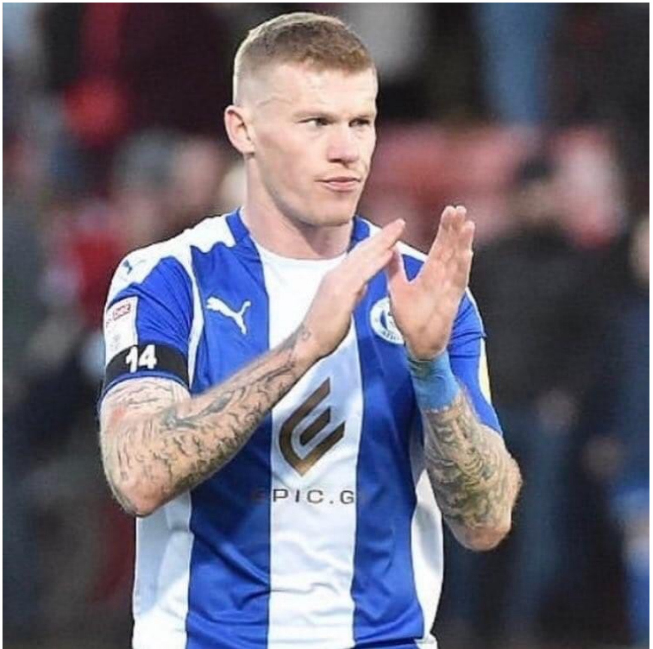
Derry Bloody Sunday March 2022; Irish Soccer Player from