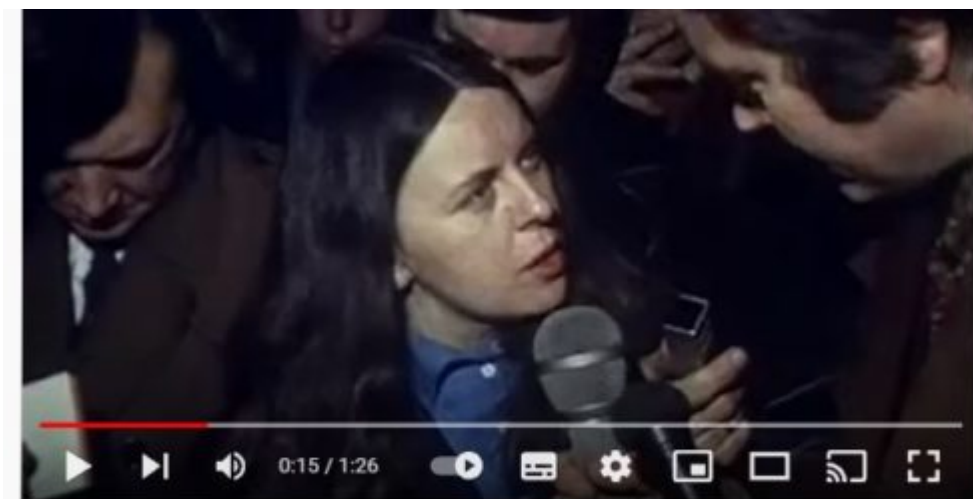
Bernadette Devlin delivers a proletarian protest (31/01/1972)

Bernadette Devlin delivers a proletarian protest (31/01/1972) – YouTube