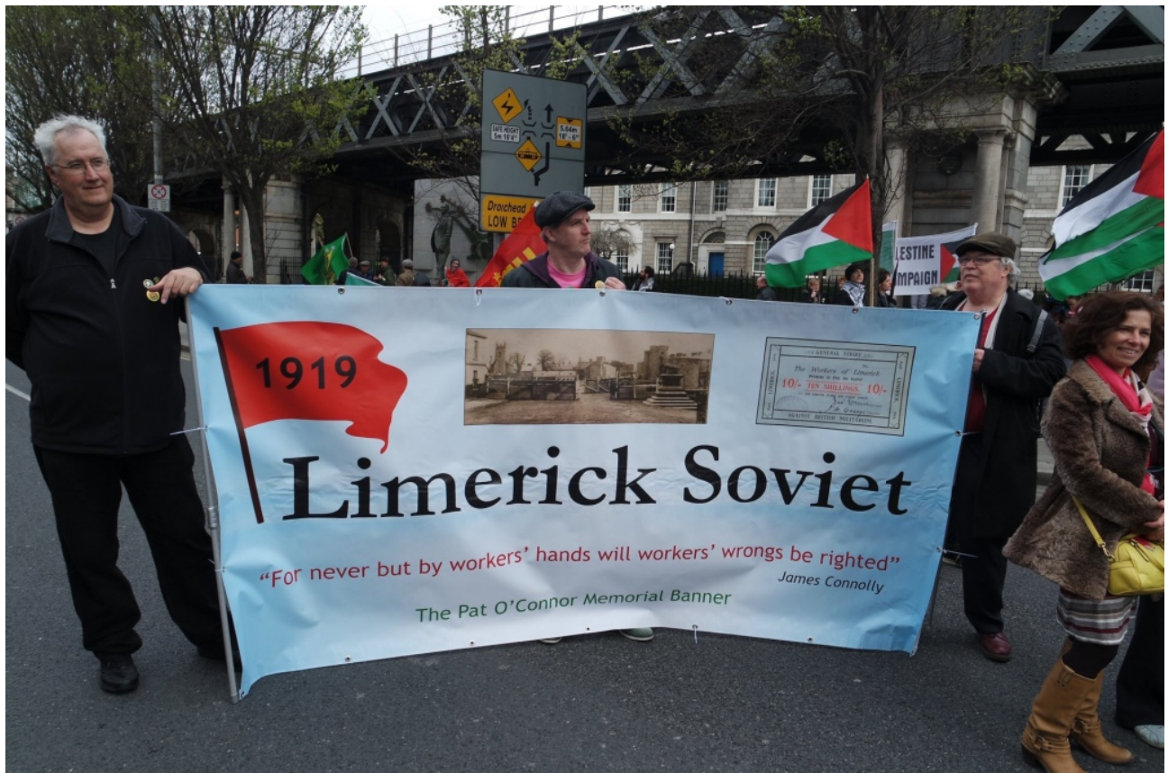
Limerick Soviet Banner Carried on April 2016 Commemoration of the Irish 1916 Easter Rising

It is very similar to what happened on the day of the 2016 100th anniversary monster parade in Dublin supporting the 1916 Rising – the Irish establishment media disgraced itself reporting on tiny religious ceremonies in Ballygobackwards and the like. It ignored tens of thousands on Dublin streets participating in a colourful parade.