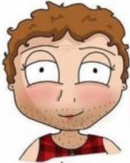
ZE | ZIR

YOU CAN'T ALWAYS TELL SOMEONE'S PRONOUNS