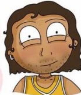
HE | THEY