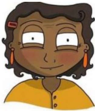
SHE | THEY