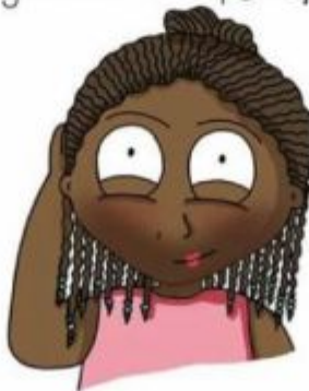
HE | THEY