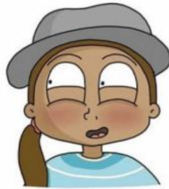
SHE | HER