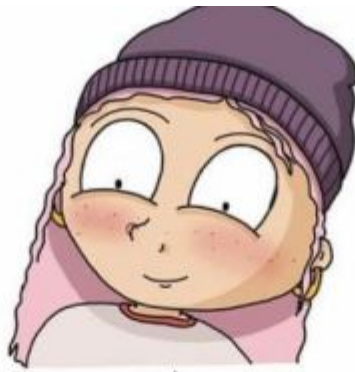
THEY | THEM