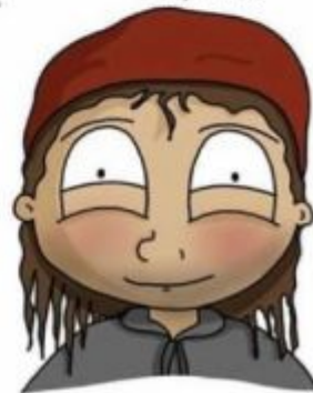
THEY | THEM