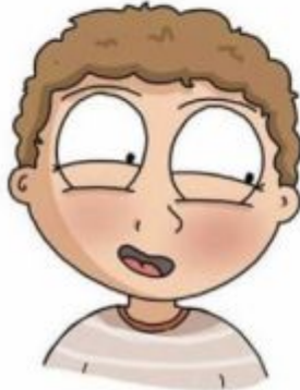
HE | HIM