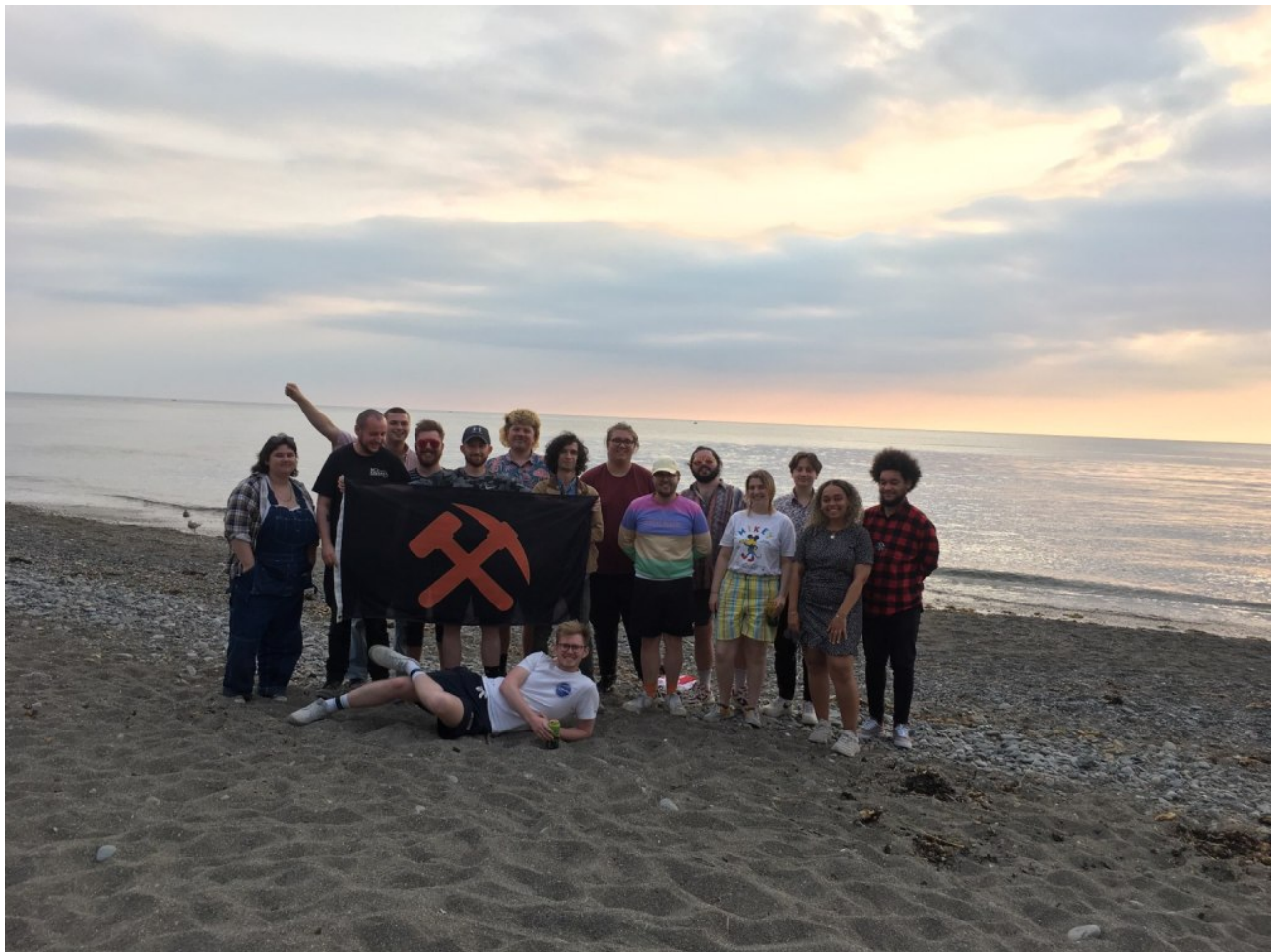
Members at our first-ever WUN Congress in Aberystwyth.

In a momentous occasion for us, we also held our first WUN Congress in Aberystwyth , where members from across Wales came together to socialise, create a Constitution, sort out internal affairs, and plan for the upcoming year.