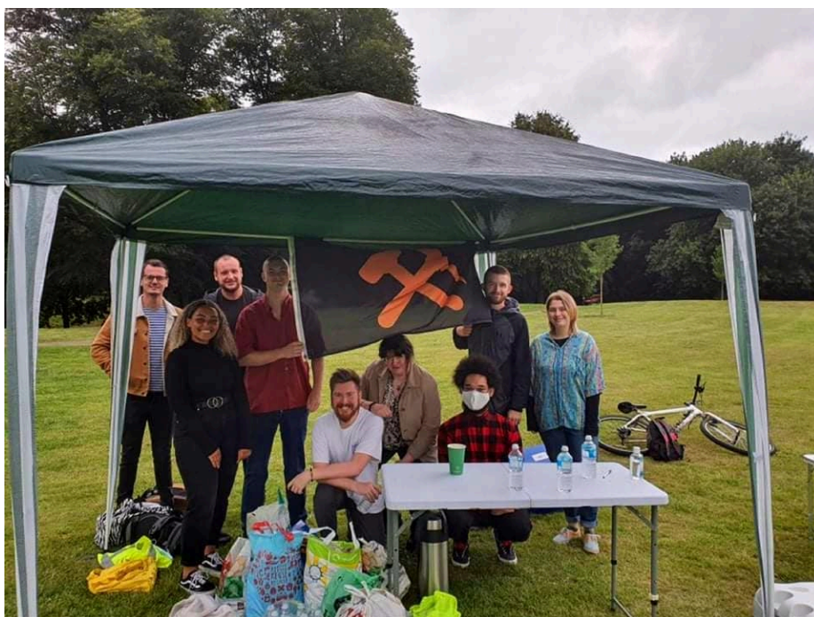
Members of our Wrexham Chapter conducting a free-food event.

From Wrexham City Center, to the Gurnos Shops in Merthyr, Blackwood, Swansea, Lansbury Park, and the Fernhill Estate, our Members have been active across Wales – providing hot food, hygiene products, and basic supplies to those who need them.