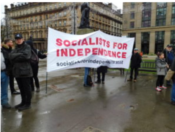
The pro independence movement supported the