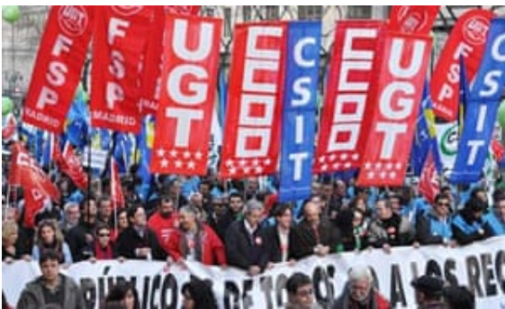
Spanish workers march against labour laws in 2012

As this is a complex issue and our readers may not be familiar with Spanish state politics, ecosocialist.scot has provided an extended glossary of its own below the article