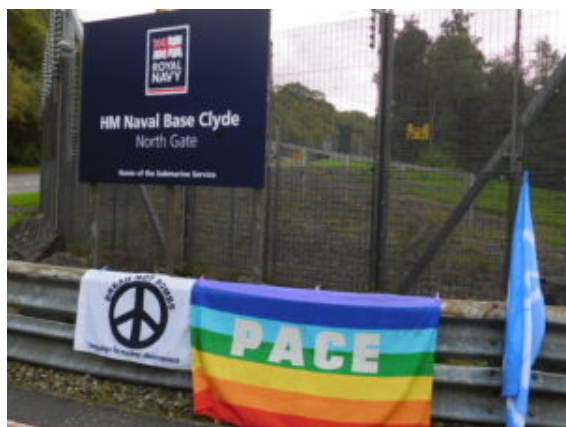
CND banners at the Faslane nuclear base (Pic: Sept

Russia's appalling actions in invading Ukraine, a state that voluntarily gave up nuclear weapons, have put pressure across Europe on governments to increase support for the NATO nuclear alliance and nuclear weapons. We need to oppose this and say loudly and clearly that nuclear weapons are no defence against imperialist actions like Russia's and that more than ever we need to remove nuclear weapons from Europe and the world. Supporting the Faslane peace camp anniversary 10-12 June, opposing Trident, and calling for more states to sign the UN Treaty on the Prohibition of Nuclear Weapons (TPNW) (which finally holds its postponed first conference of signatories and civil society in Vienna late June) are among the best ways of bringing an effective future world free from weapons of mass destruction.