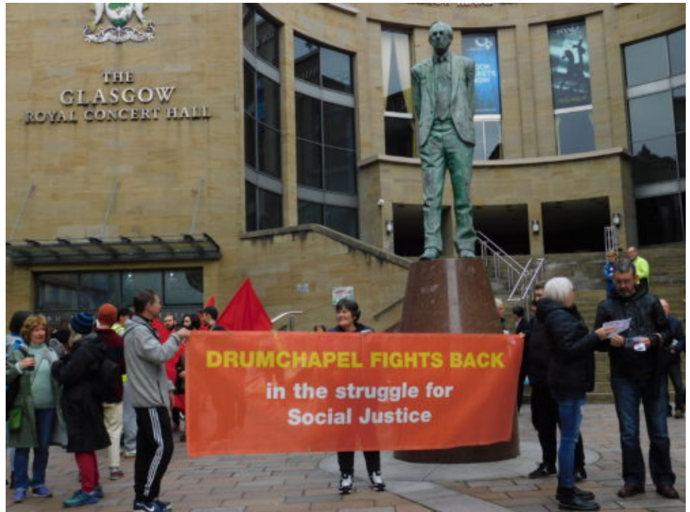
Drumchapel residents protest under the watchful eye of Donald Dewar