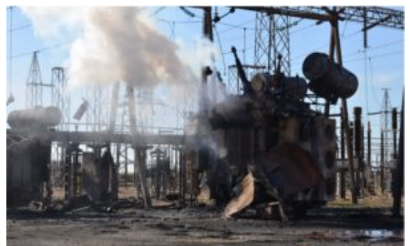
Damage caused by Turkish air attacks on civilian electricity infrastructure in Suwaydiyah North & East Syria.

The apparent invitation arose after Scottish First Minister, and leader of the governing Scottish National Party (SNP), Humza Yousaf met briefly with the Turkish state President while they were both in Dubai in December 2023 for the COP28 summit. Kurds are angry that Erdoğan is using the Gaza crisis to launch military attacks on Kurdish populations inside both the Syrian and Iraqi state and continue his persecution and murderous policies towards the 10 million Kurds inside the Turkish state. In the Kurdish-led liberated region of Rojava in neighbouring Syria, Erdoğan has committed exactly the same sort of brutal bombing and attacks on civilian infrastructure that he accuses Israel of in Gaza.