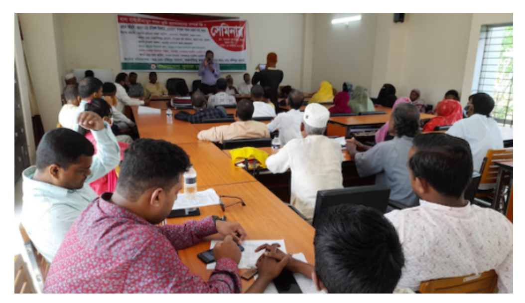
Seminar on 'What is the relationship between land movement and food sovereignty?', October 15, 2022 organized by Bangladesh Krishok Federation

concept. Rather, it is the implementation of food sovereignty through mobilizations that could optimally eliminate hunger and poverty in rural areas.