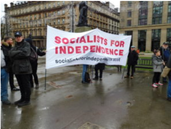
The pro independence movement supported the protest.