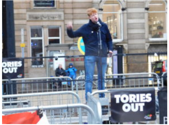
Fridays for the Future Speaker talked about saving the planet.