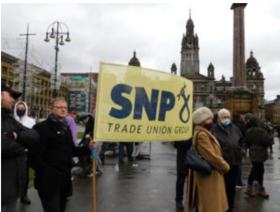
The SNP Trade Union Group supported the protest