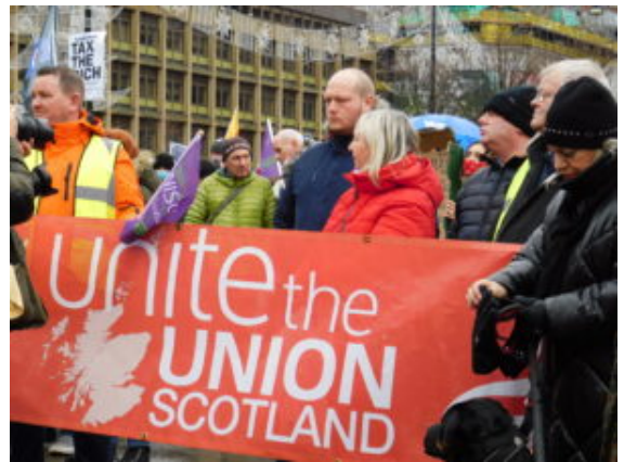
Unions were leading the protest.