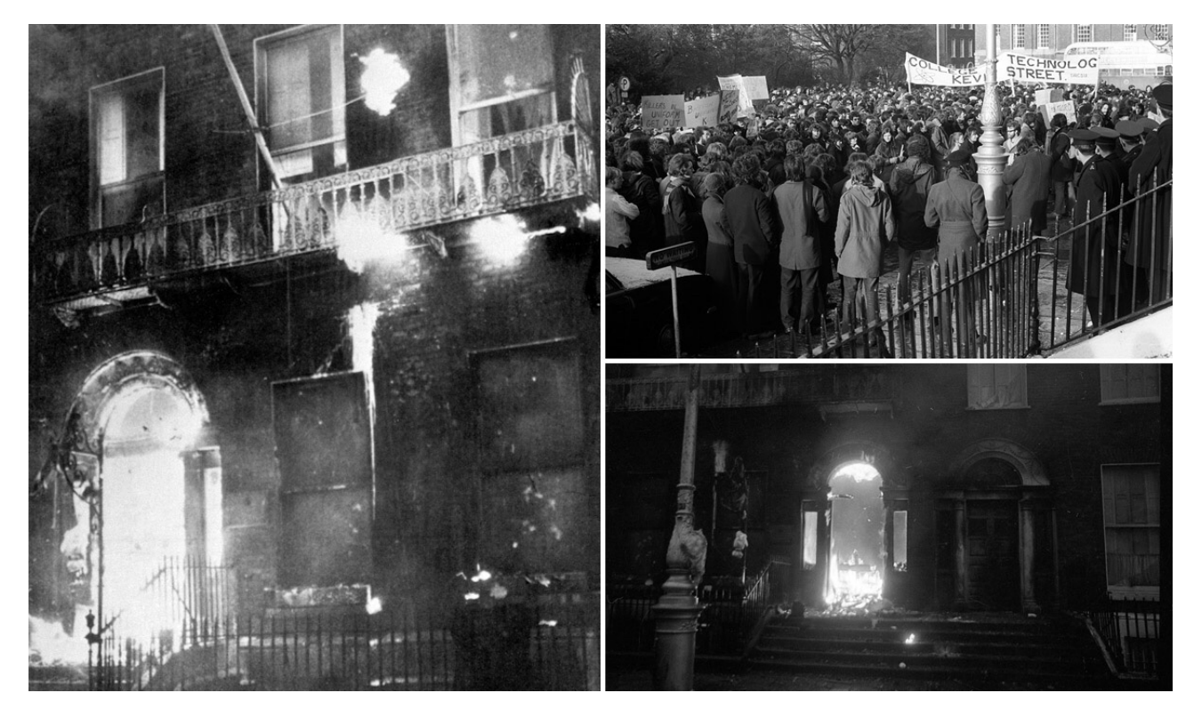
The establishment media has not said too much about a general strike which swept across Ireland because of Derry's Bloody