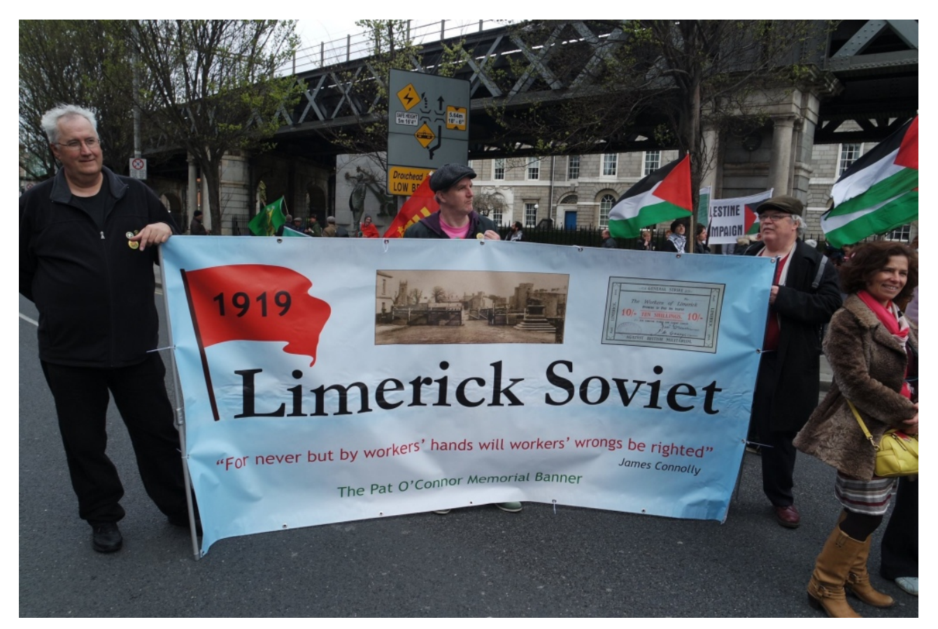
Limerick Soviet Banner Carried on April 2016 Commemoration of the Irish 1916 Easter Rising

The weather did not stop the people of Derry as thousands took part in the March for Justice on the 50th anniversary of Bloody Sunday.