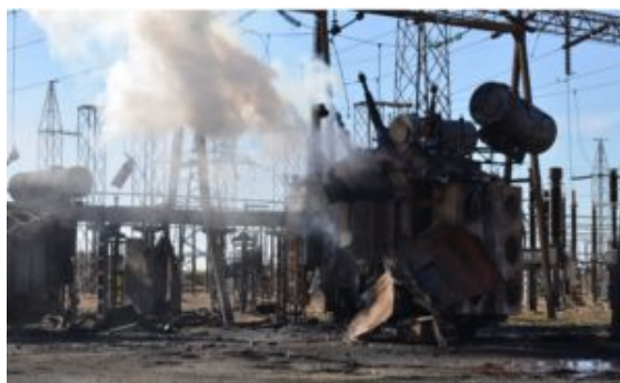
Damage caused by Turkish air attacks on civilian electricity infrastructure in Suwaydiyah North & East Syria.

The apparent invitation arose after Scottish First Minister, and leader of the governing Scottish National Party (SNP), Humza Yousaf met briefly with the Turkish state President while they were both in Dubai in December 2023 for the COP28 summit. Kurds are angry that Erdoğan is using the Gaza crisis to launch military attacks on Kurdish populations inside both the Syrian and Iraqi state and continue his persecution and murderous policies towards the 10 million Kurds inside the Turkish state. In the Kurdish-led liberated region of Rojava in neighbouring Syria, Erdoğan has committed exactly the same sort of brutal bombing and attacks on civilian infrastructure that he accuses Israel of in Gaza.