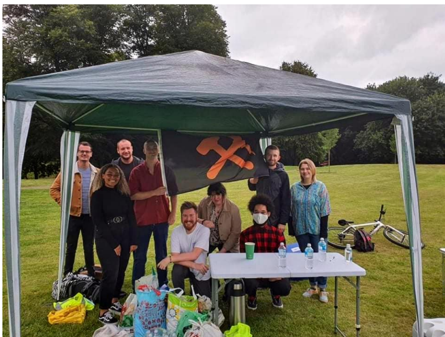
Members of our Wrexham Chapter conducting a free-food event.

From Wrexham City Center, to the Gurnos Shops in Merthyr, Blackwood, Swansea, Lansbury Park, and the Fernhill Estate, our Members have been active across Wales – providing hot food, hygiene products, and basic supplies to those who need them.